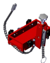
Pipe attachment DMP 251