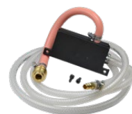
Compressed air ejector